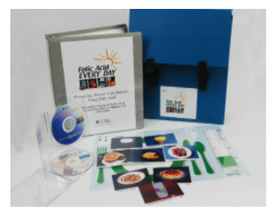
"Folic Acid Every Day" Toolkit Updated for 2006

The "Folic Acid Every Day" toolkit, in English or Spanish, is available for purchase at the IFAS Extension Bookstore by calling (352) 392-1764 or at the bookstore Web site at www.ifasbooks.com.